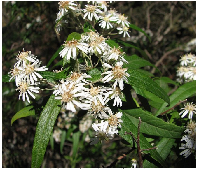
Snowy Daisy (Olearia lirata)